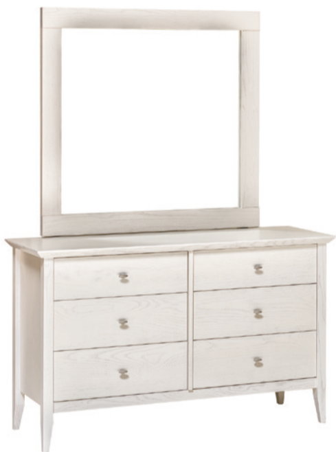
Aria 6 Drawer Dresser / Mirror

Aria is a classic, well-proportioned design which showcases the natural beauty of the timber. Aria Bedroom is available in your choice of American Ash timber or native New Zealand Rimu. Cabinet tops, drawer fronts & posts are manufactured from solid timber, which along with traditional multi-groove dowelled construction ensures rigidity and longevity. Cabinet Drawers are polished inside and out and glide effortlessly on European Quadro ball bearing runners. Cabinet end panels and headboard panels are made from either Ash or Rimu veneer.