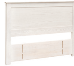
Aria Headboards King-Single - 1220L x 1200H x 70D Queen - 1650L x 1200H x 70D King - 1800L x 1200H x 70D Superking - 1950L x 1200H x 70D