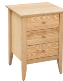
Aria 3 Drawer Narrow 500W x 660H x 450D