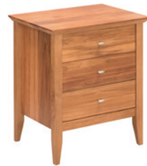
Aria 3 Drawer Bedside 590W x 660H x 450D