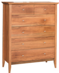
Aria 6 Drawer Chest 1020W x 1275H x 450D