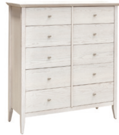
Aria 10 Drawer Twin Chest 1180W x 1275H x 450D