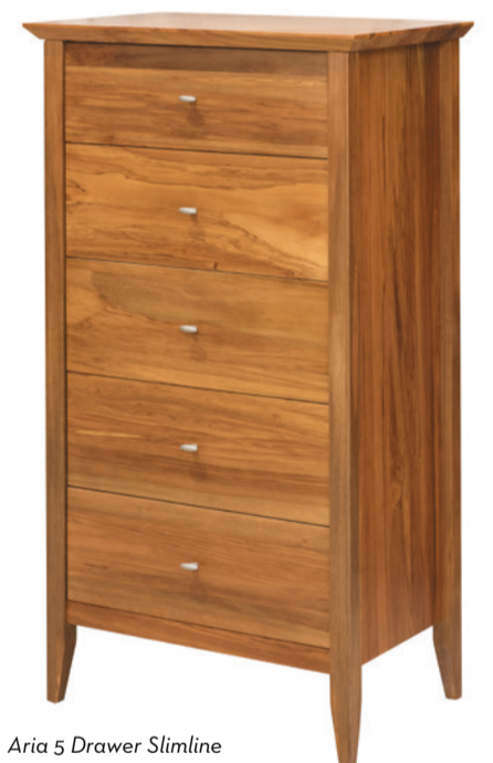
Aria 5 Drawer Slimline

New Zealand native Rimu is a beautifully grained native timber which is highly valued for its grain and colour. Very small amounts are harvested each year which means New Zealand Rimu is becoming very exclusive and highly sought after.