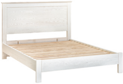
Aria Duvet Foot Bedframe Queen - 1650W x 2125L x 1200H King - 1800W x 2125L x 1200H Super King - 1950W x 2125L x 1200H Duvet Foot: 360H