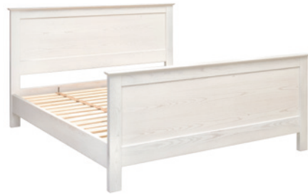
Aria High Foot Bedframe Queen - 1650W x 2125L x 1200H King - 1800W x 2125L x 1200H Super King - 1950W x 2125L x 1200H