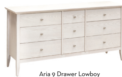
Aria 9 Drawer Lowboy 1650W x 795H x 450D