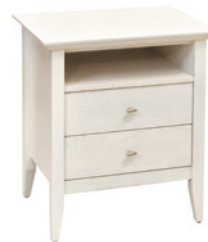
Aria 2 Drawer / Open shelf Bedside 590W x 660H x 450D