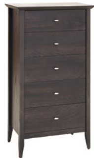
Aria 5 Drawer Slimline 715W x 1275H x 450D