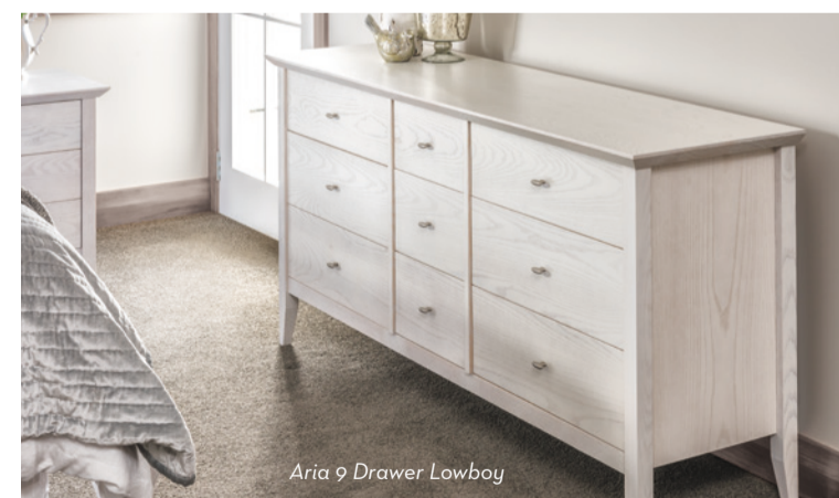
Aria 9 Drawer Lowboy

All Drawers glide smoothly on Quadro Ballbearing runners with a soft close mechanism giving that whisper quiet close. These top quality runners have a lifetime warranty and are concealed underneath the drawer.