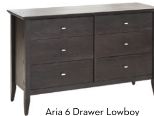
Aria 6 Drawer Lowboy 1300W x 795H x 450D