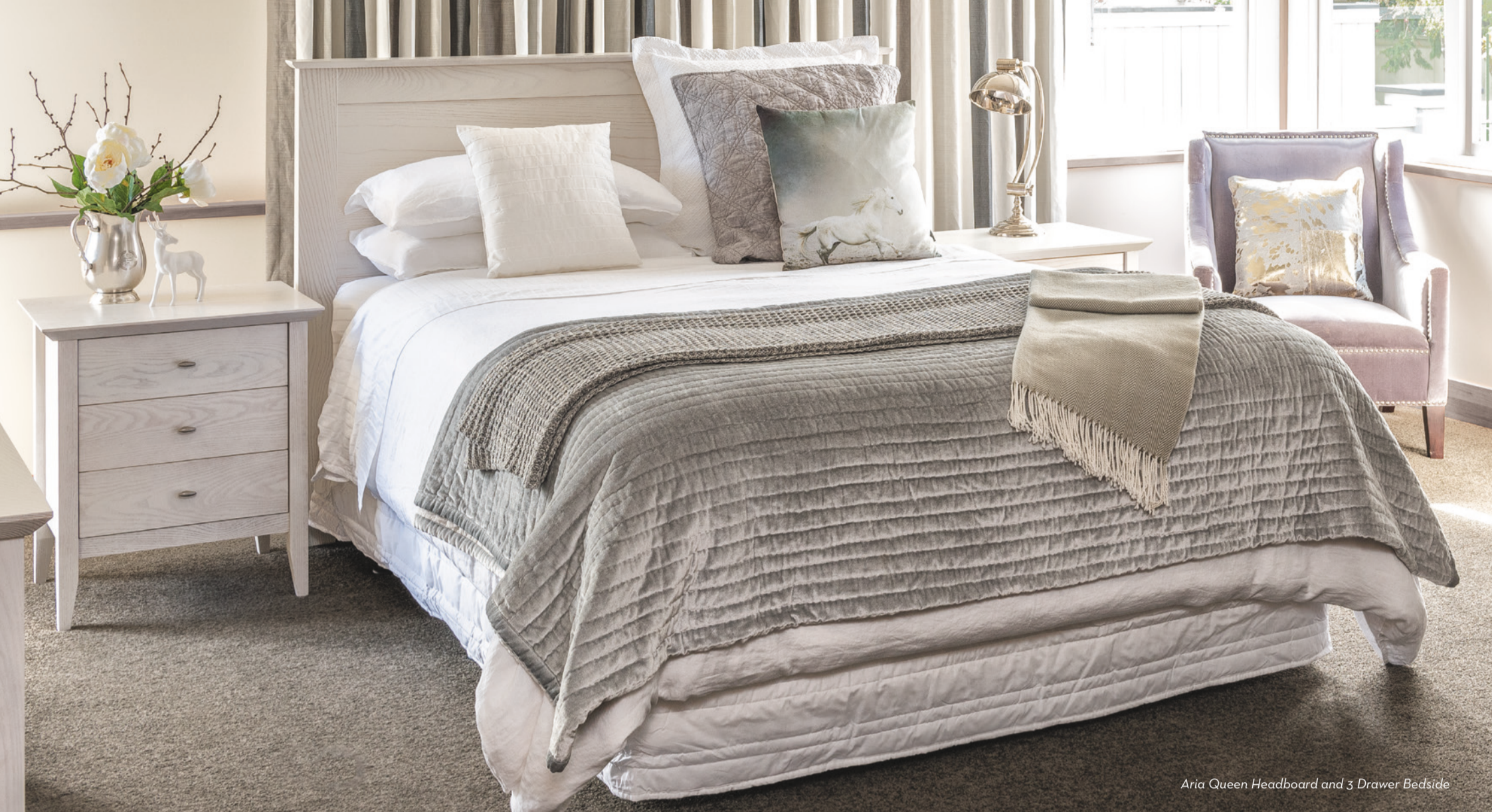
Aria Queen Headboard and 3 Drawer Bedside